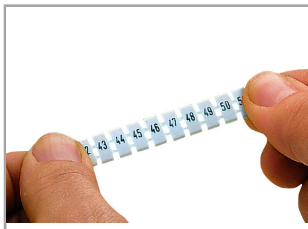
Stretching a WMB marker strip.