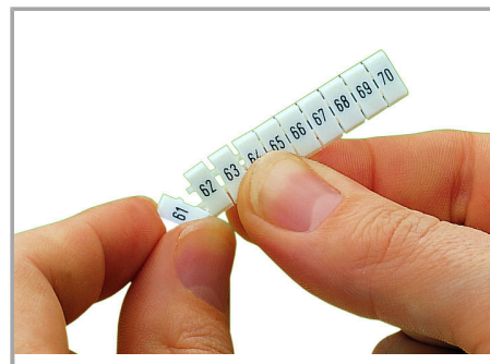
Separating an individual marker from the WMB marker strip – for larger terminal blocks.