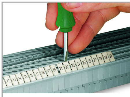
Snapping a marking strip into the marker slot.