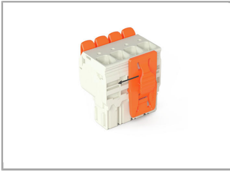
Locking lever for field assembly