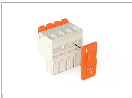
Locking lever for field assembly