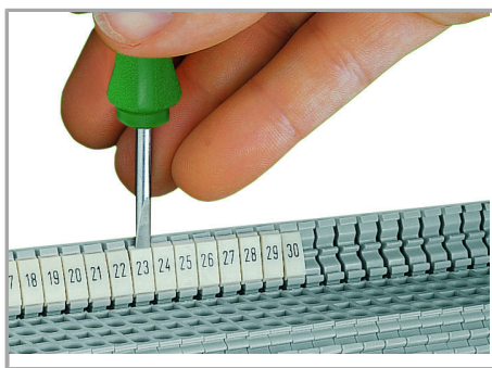
Snapping a WMB marker strip into the marker slot of the double marker carrier.