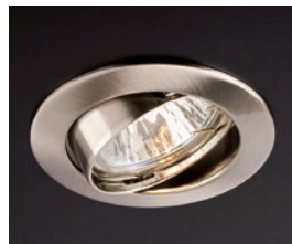
Nickel mat (NM)