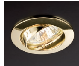
Polish brass (PB)