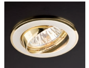
Pearl silver/Gold (PS/G)