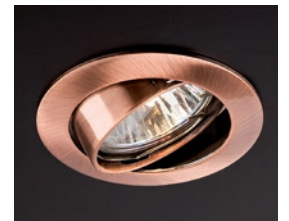
Antique brass (AB)