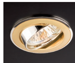
Pearl gold/Silver (PG/S)