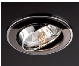
Gun metal/Chrome (GM/CH)