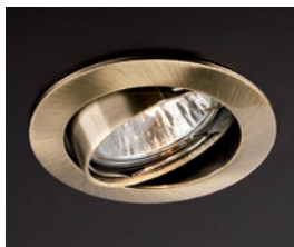
Red antique brass (RAB)