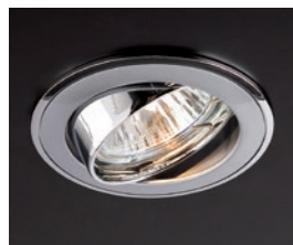
Pearl chrome/Chrome (PC/CH)