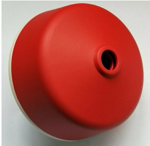
0 601 97