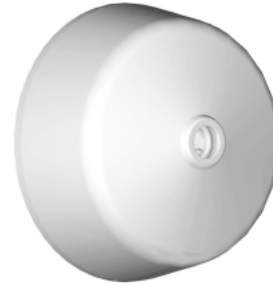
0 601 98