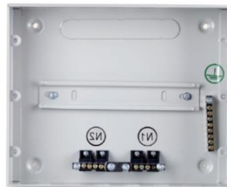
DIN, zero and ground terminals included