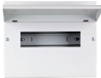
Modern design and aesthetic look

The metal distribution boxes have wide range of application for mounting in buildings under construction or new communal objects, offices, shops, house facilities. Inside the box, could be mounted circuit elements for protection in the electrical installation. They are made of high quality electro-galvanized steel sheet and provide proper prevention from fire. They are shock-proof as well. The box is also equipped with copper zero and ground terminals.