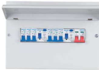
Different variants of assembling