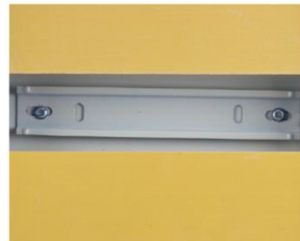
Defense of the electrical parts from direct contact