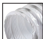
White ( )