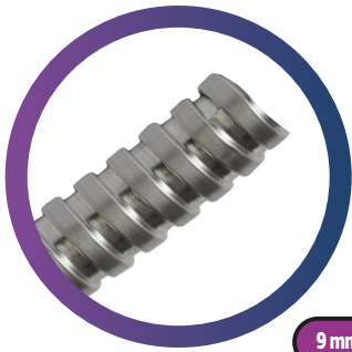
STEEL FLEXIBLE CONDUIT