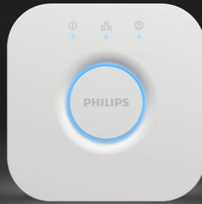
Philips Hue Bridge