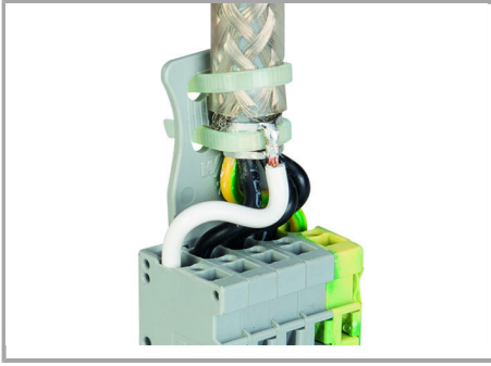
Shield termination connected to an X-COM® female plug