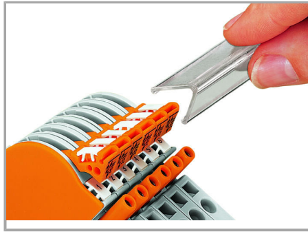
Snapping a transparent locking cover onto 1–8 disconnect links:

a) Mechanically lock several links for multi-pole switching applications