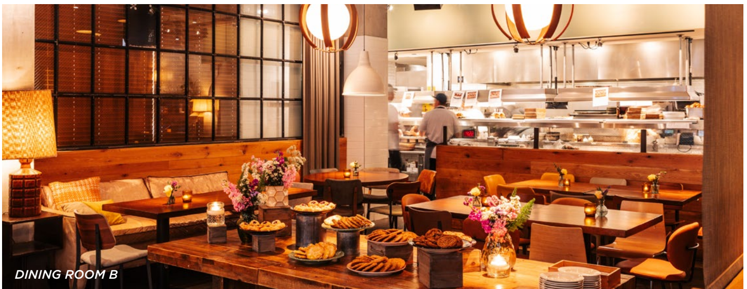
DINING ROOM B

High Top Tables • Operable Windows Lounge Seating • Private Bar