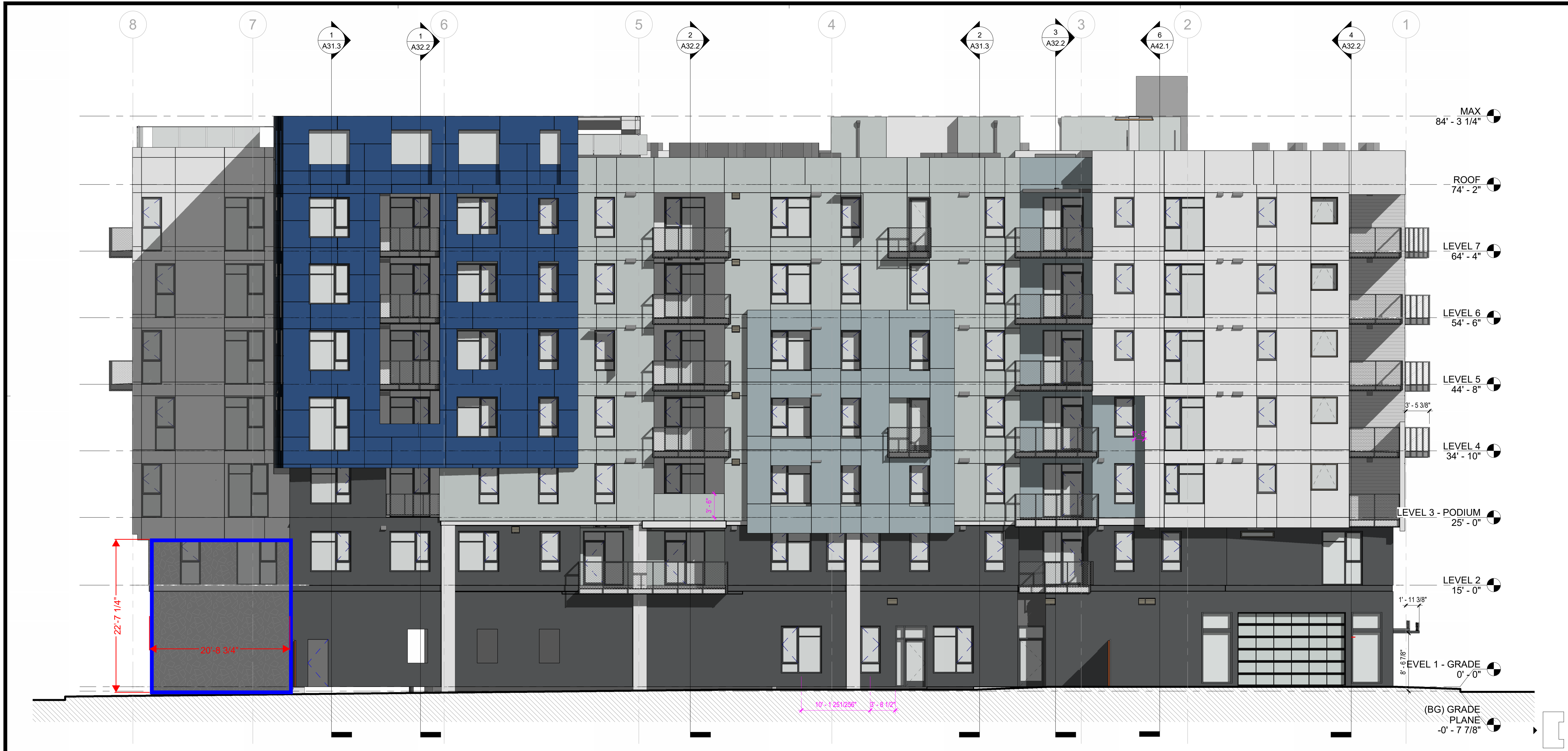
WEST ELEVATION 1/8" = 1'-0" 2