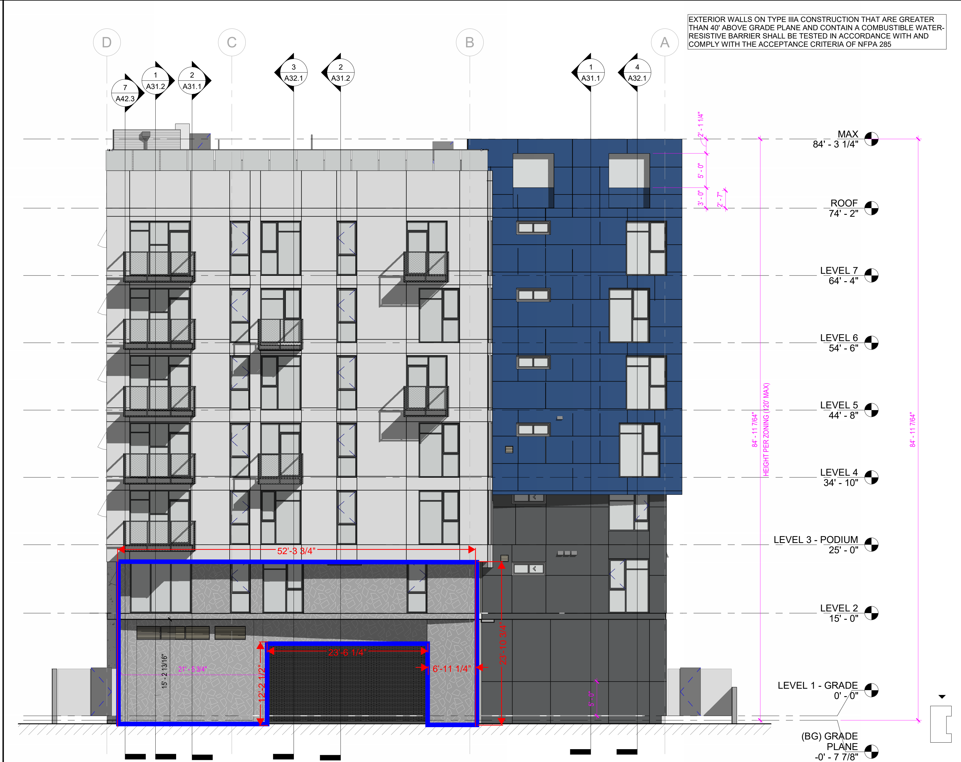
NORTH (37TH) 1/8" = 1'-0" 1