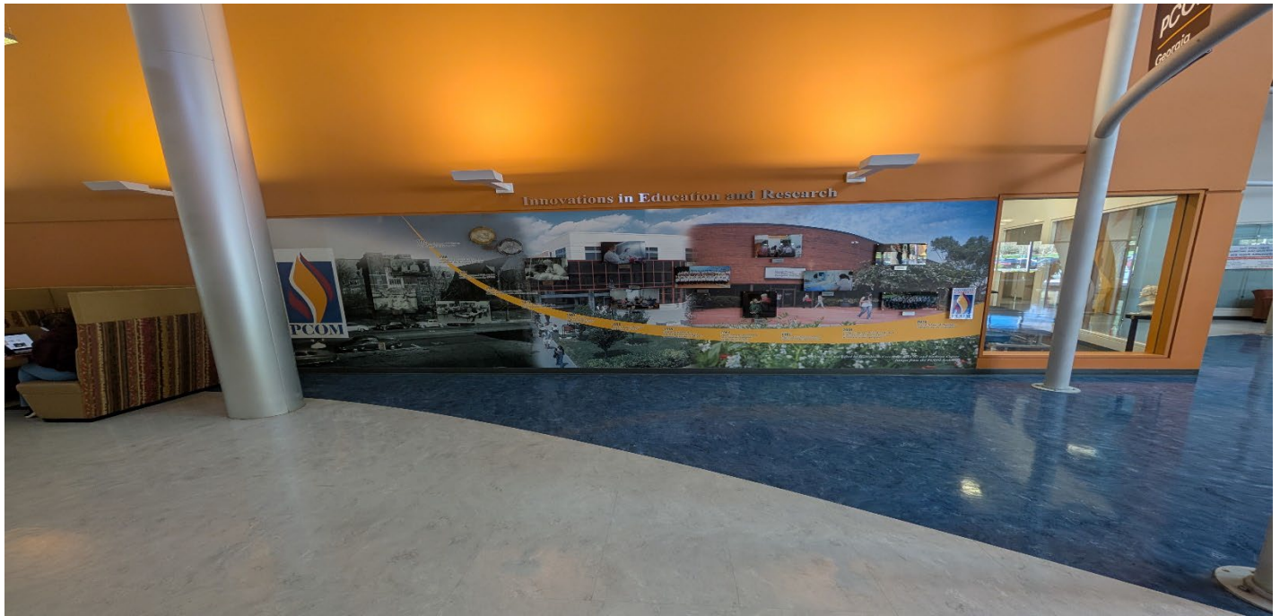
Photo of nearby wall mural (for reference; this wall is not part of the project and will remain)