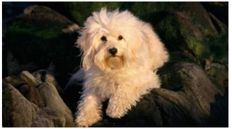
DEAR GOD: Let me give you a list of just some of the things I must remember to be a good dog.

1. I will not eat the cats' food before they eat it or after they throw it up.