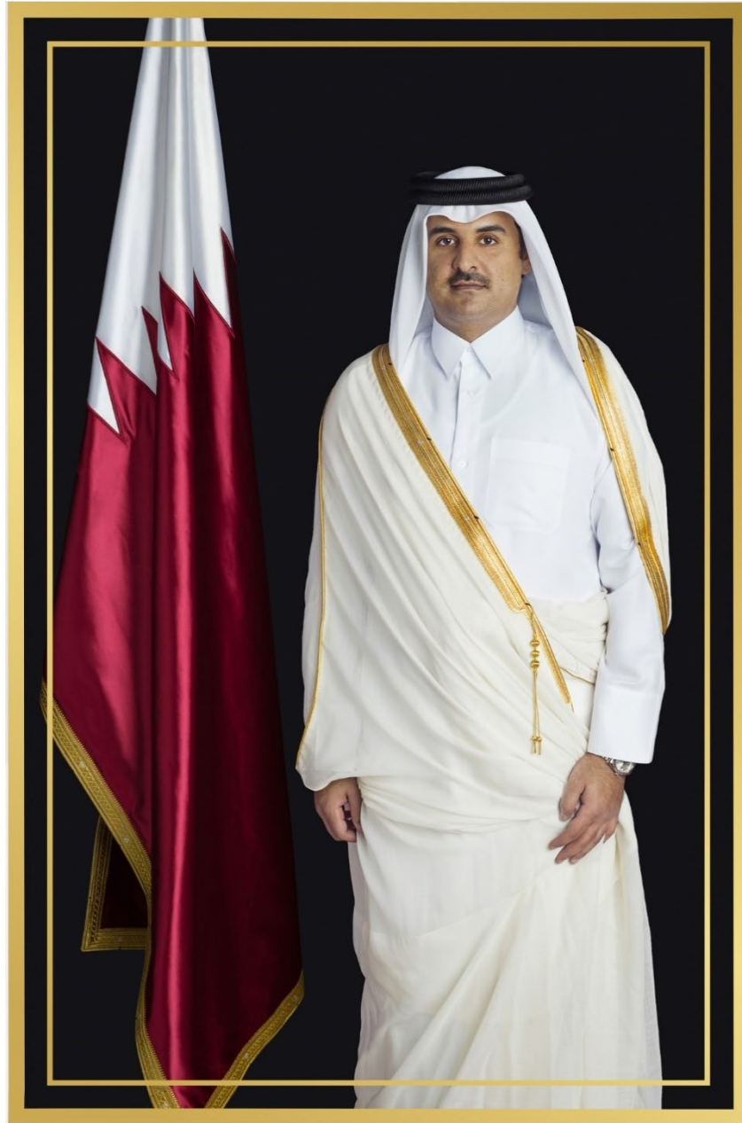
H.H. Sheikh Tamim bin Hamad Al Thani The Amir State of Qatar