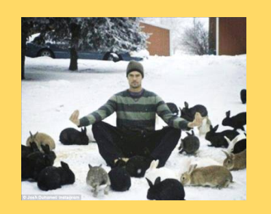
Memory tip: To get among (= surrounded by) a group or people.

Meaning: Being surrounded by Get = to cause to be Among = surrounded by