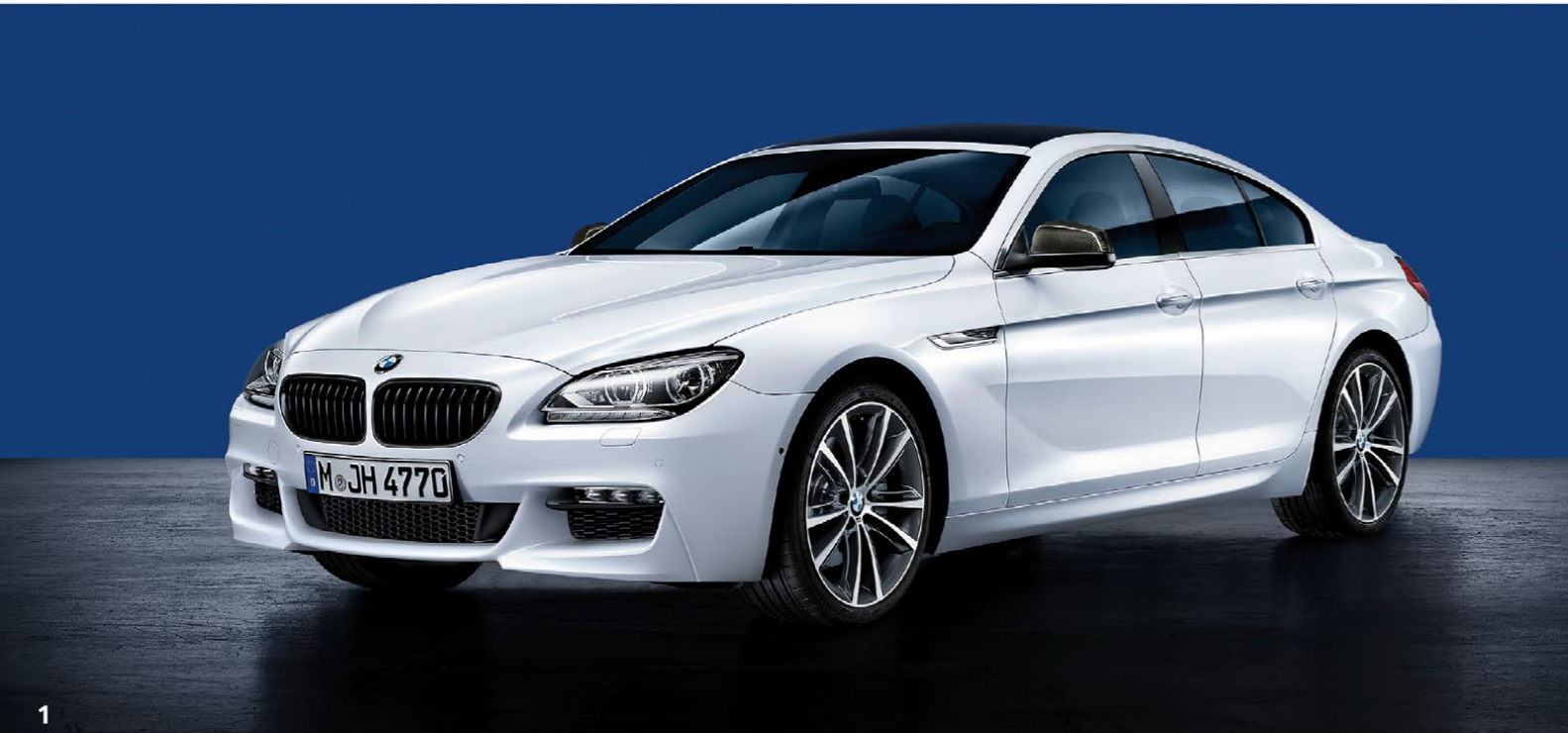
1 BMW M Performance front grille, black