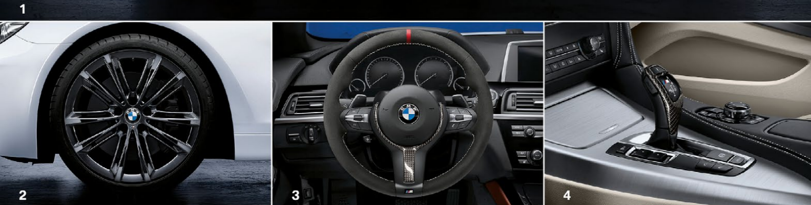
4 BMW M Performance gear lever trim, carbon for Sport automatic

The Alcantara steering wheel II with carbon trim and a 373mm diameter features hand-stitched silver-grey cross-stitching and emphasises sportiness with a red centring strip in leather. The steering wheel trim with the BMW M logo is finished in lacquered, highly polished carbon fibre. For vehicles with the BMW M Sport package or the BMW M Sport steering wheel.