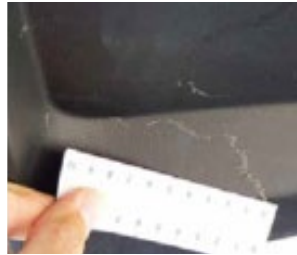
Nail-sensitive scratch or tearing of material. Broken trim or bad repair quality.