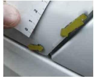
Poor paint job, with paint dripping (if painted through a non-authorized repairer).