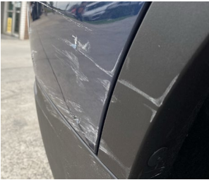
More than 25mm in length and depth and more than 2 per panel.