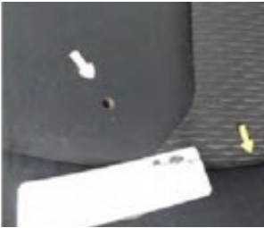
Degraded interior with cigarette burns and tears or indelible stain.