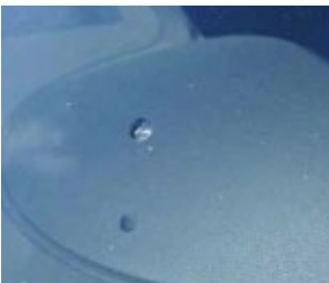
Major chips, bullseyes and stars (and minor chips in field of vision).