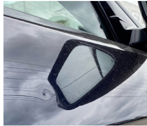
Greater than 20mm diameter or paint surface penetration.