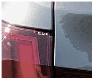
Non-operational or cracked/broken headlights or lenses.