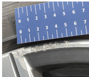
Scratches greater than 25mm in length and wider than 1mm.