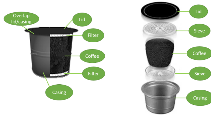
Figure C.1. Examples of typical coffee pod structures