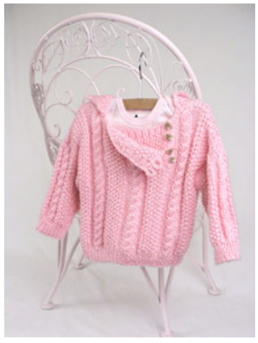
Click to enlarge image schematic

designed by Marilyn Losee TECHNIQUE USED: Knit