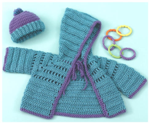
click to enlarge image schematic

Small (Medium, Large) to fit: Baby 6-12 months (18-24 months, Child's 2-4)