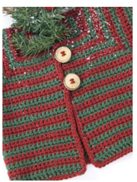
click images to enlarge