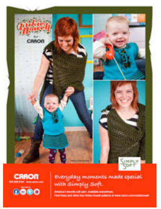
Click to Enlarge As seen in our recent ad

repeat from * to last 3 ch, ch 2, sk next 2 ch, sl st in last ch, turn-90 B-sts.