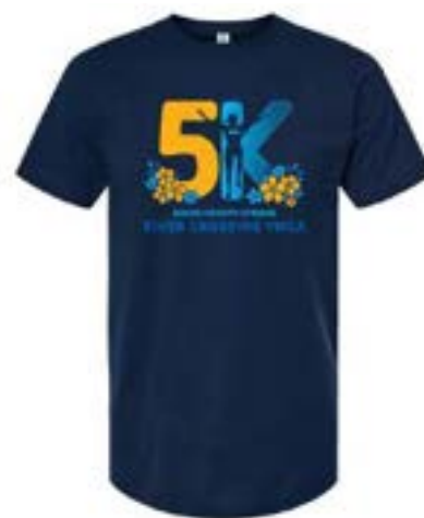
NEW SHIRT DESIGN