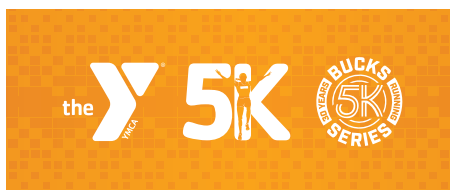
NEW RIBBON DESIGN