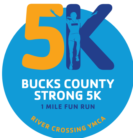
NEW MEDAL DESIGN

STRONG is in our name and it takes 100+ volunteers to bring our YMCA Bucks County Strong 5K runners, walkers and ruckers across the finish line.