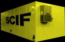
SENSITIVE COMPARTMENTED INFORMATION FACILITY