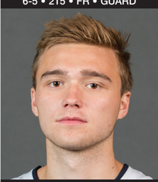
GILBERT, ARIZONA HIGHLAND HS