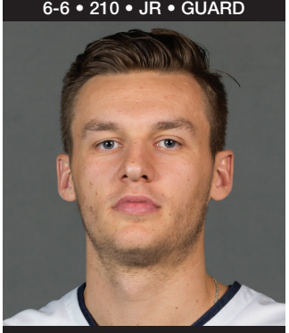
PROVO, UTAH PROVO HS