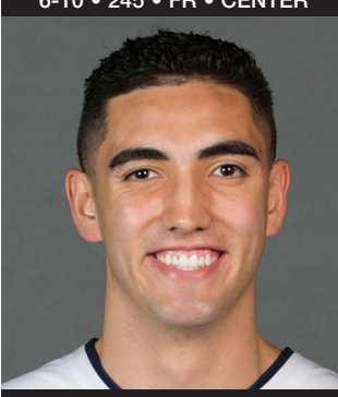
PROVO, UTAH TIMPVIEW HS