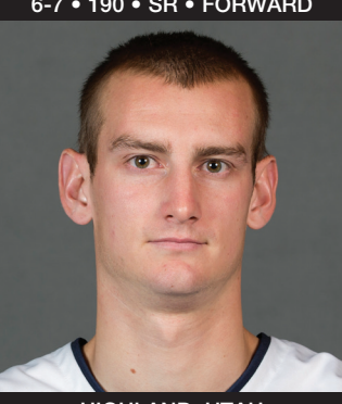
HIGHLAND, UTAH UTAH