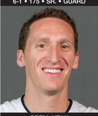
OREM, UTAH SALT LAKE CC