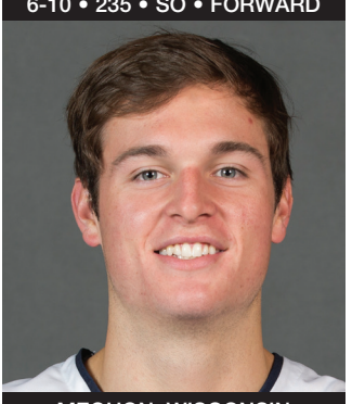
MEQUON, WISCONSIN HOMESTEAD HS