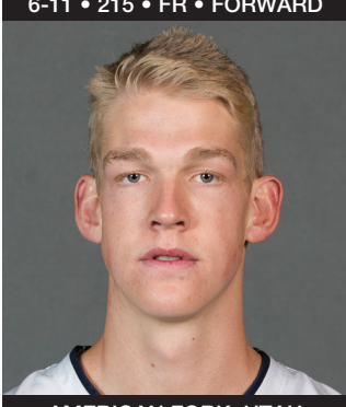
AMERICAN FORK, UTAH AMERICAN FORK HS