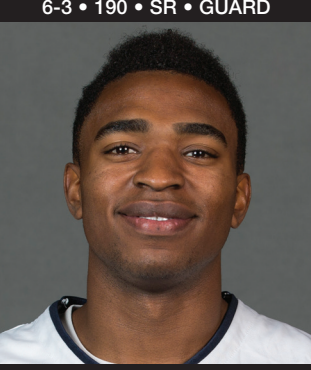
LAS VEGAS, NEVADA BISHOP GORMAN