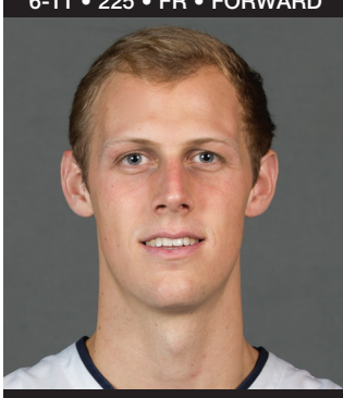
MISSION VIEJO, CALIFORNIA MISSION VIEJO HS