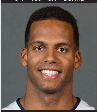
MEDFORD, OREGON PORTLAND STATE

2014-15 SEASON - PPG: 0.3 RPG: 0.4 APG: 0.4 SPG: 0.1 BPG: 0.0 FG%: .500 3FG%: .000 FT%: .000