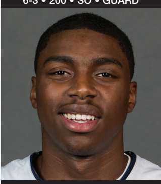
BATON ROUGE, LOUISIANA FUTURE COLLEGE PREP