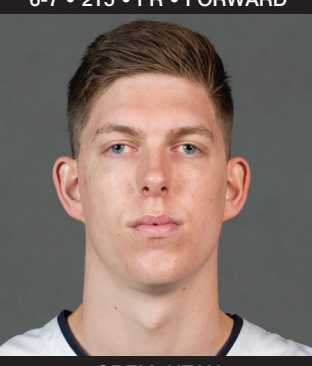
OREM, UTAH OREM HS