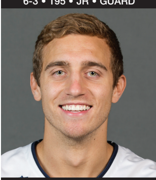
RIPLEY, WEST VIRGINIA WAKE FOREST