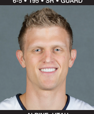
ALPINE, UTAH LONE PEAK HS