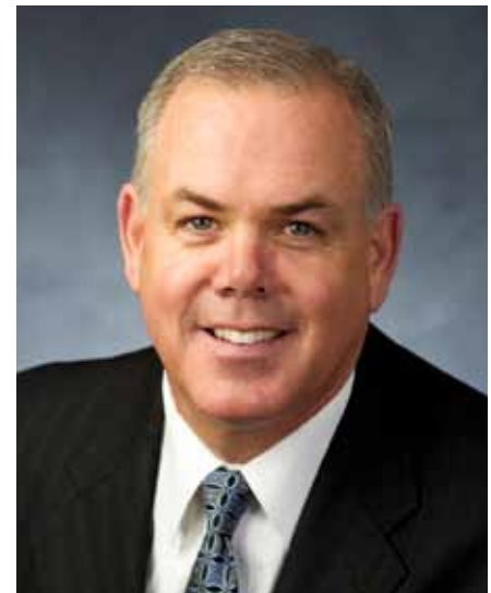
Scan to view Rose's profile on BYUcougars.com