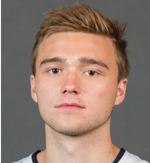
GILBERT, ARIZONA HIGHLAND HS