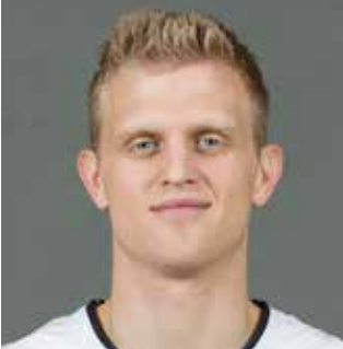
ALPINE, UTAH LONE PEAK HS

2013-14 SEASON — PPG: 22.3 RPG: 5.2 APG: 1.4 SPG: 1.0 BPG: 0.1 FG%: .454 3FG%: .424 FT%: .855