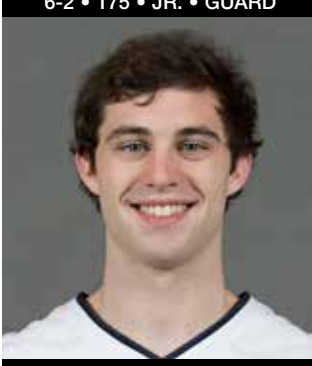
ARCADIA, ARIZONA BLOOMINGTON SOUTH HS