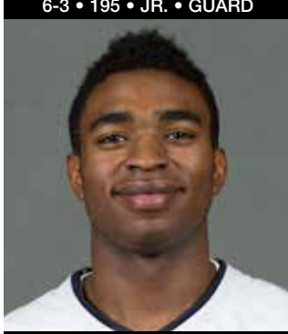
LAS VEGAS, NEV. BISHOP GORMAN