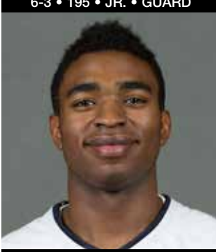
LAS VEGAS, NEV. BISHOP GORMAN