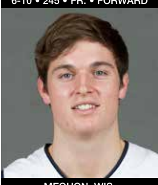
MEQUON, WIS. HOMESTEAD HS