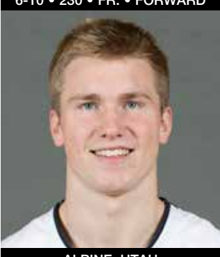
ALPINE, UTAH LONE PEAK HS