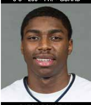
BATON ROUGE, LA.