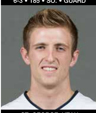
ST. GEORGE, UTAH SNOW CANYON HS