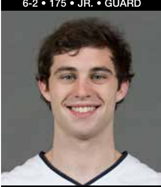
ARCADIA, ARIZONA BLOOMINGTON SOUTH HS