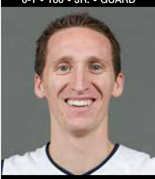
OREM, UTAH SALT LAKE CC