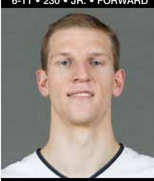
ALPINE, UTAH LONE PEAK HS