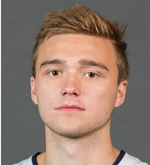
GILBERT, ARIZONA HIGHLAND HS