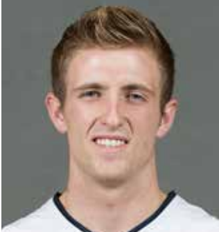
ST. GEORGE, UTAH SNOW CANYON HS