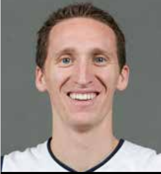
OREM, UTAH SALT LAKE CC