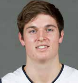
MEQUON, WIS. HOMESTEAD HS