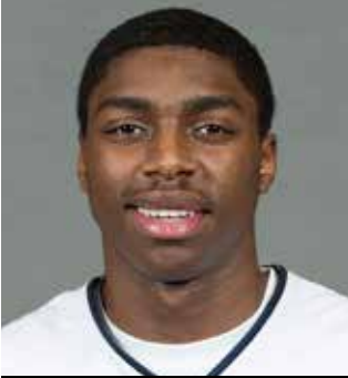
BATON ROUGE, LA. FUTURE COLLEGE PREP