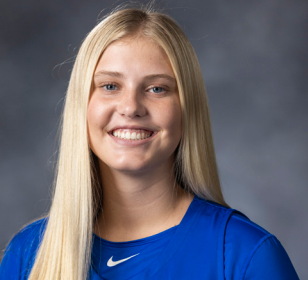
Blank (like blank check)