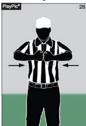
Illegal blindside block