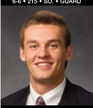
PROVO, UTAH PROVO HS