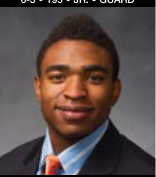
LAS VEGAS, NEV.