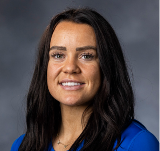
Twitter: @laurengus10 Instagram: @laurengustinn