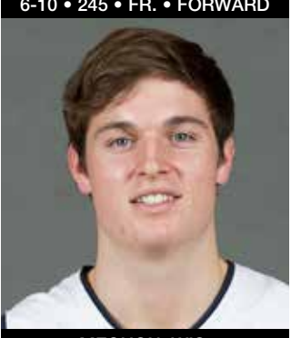
MEQUON, WIS. HOMESTEAD HS