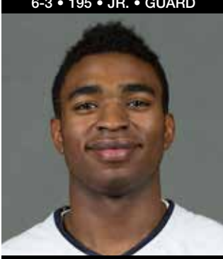
LAS VEGAS, NEV. BISHOP GORMAN