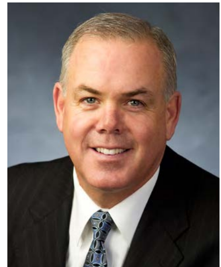
Scan to view Rose's profile on BYUcougars.com