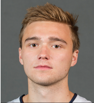
GILBERT, ARIZONA HIGHLAND HS