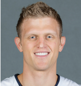
ALPINE, UTAH LONE PEAK HS

2014-15 SEASON — PPG: 23.8 RPG: 4.5 APG: 2.4 SPG: 0.8 BPG: 0.5 FG%: .497 3FG%: .434 FT%: .901