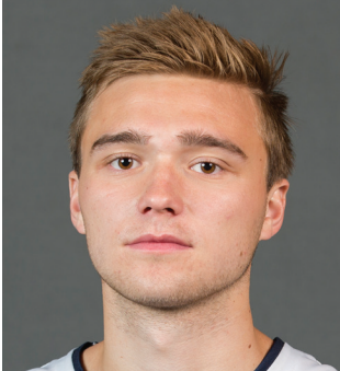
GILBERT, ARIZONA HIGHLAND HS