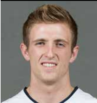
ST. GEORGE, UTAH SNOW CANYON HS

2013-14 SEASON — PPG: 0.5 RPG: 1.0 APG: 0.5 SPG: 0.0 BPG: 0.0 FG%: .000 3FG%: .000 FT%: .500