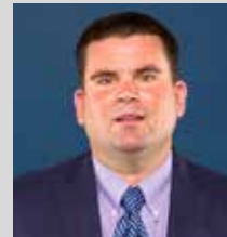
Geep Wade Offensive Line