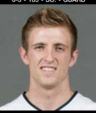
ST. GEORGE, UTAH SNOW CANYON HS