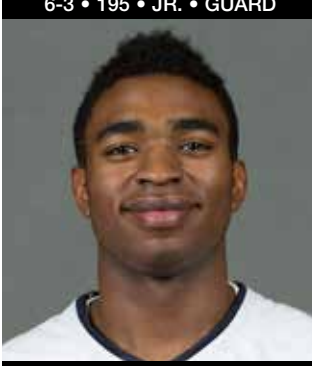
LAS VEGAS, NEV. BISHOP GORMAN