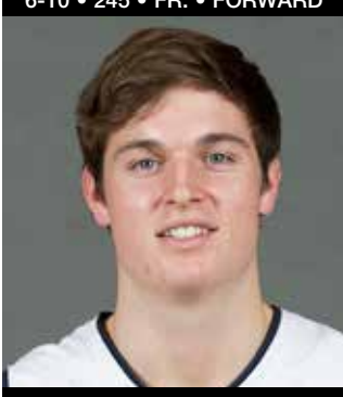
MEQUON, WIS. HOMESTEAD HS