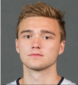
GILBERT, ARIZONA HIGHLAND HS