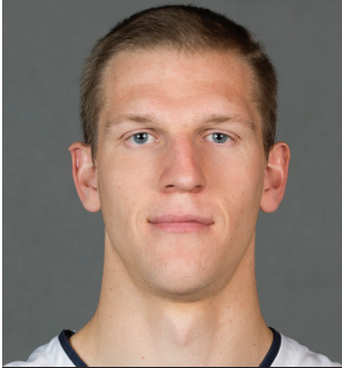
ALPINE, UTAH LONE PEAK HS