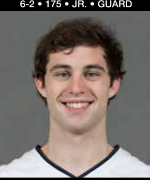
SCOTTSDALE, ARIZONA BLOOMINGTON SOUTH HS