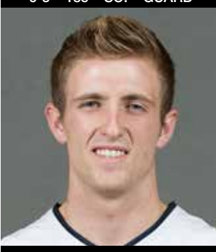
ST. GEORGE, UTAH SNOW CANYON HS