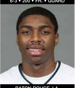
BATON ROUGE, LA. FUTURE COLLEGE PREP