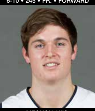
MEQUON, WIS. HOMESTEAD HS