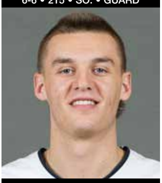
PROVO, UTAH PROVO HS