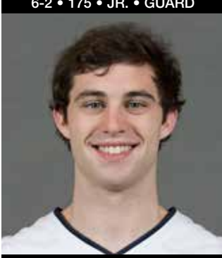
ARCADIA, ARIZONA BLOOMINGTON SOUTH HS