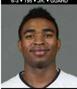
LAS VEGAS, NEV. BISHOP GORMAN