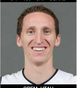
OREM, UTAH SALT LAKE CC