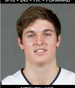
MEQUON, WIS. HOMESTEAD HS