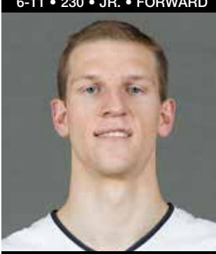
ALPINE, UTAH LONE PEAK HS