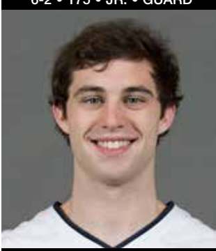
ARCADIA, ARIZONA BLOOMINGTON SOUTH HS