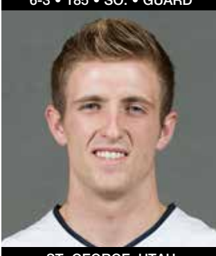
ST. GEORGE, UTAH