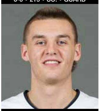
PROVO, UTAH PROVO HS