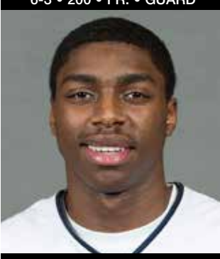
BATON ROUGE, LA. FUTURE COLLEGE PREP