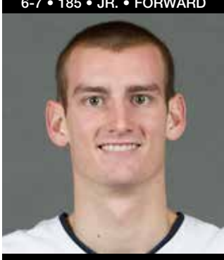
HIGHLAND, UTAH UTAH