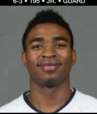
LAS VEGAS, NEV. BISHOP GORMAN