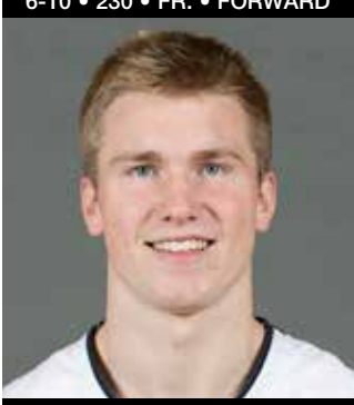
ALPINE, UTAH LONE PEAK HS