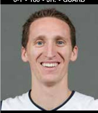
OREM, UTAH SALT LAKE CC