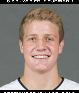
GREENWOOD VILLAGE, COLO. CHERRY CREEK HS